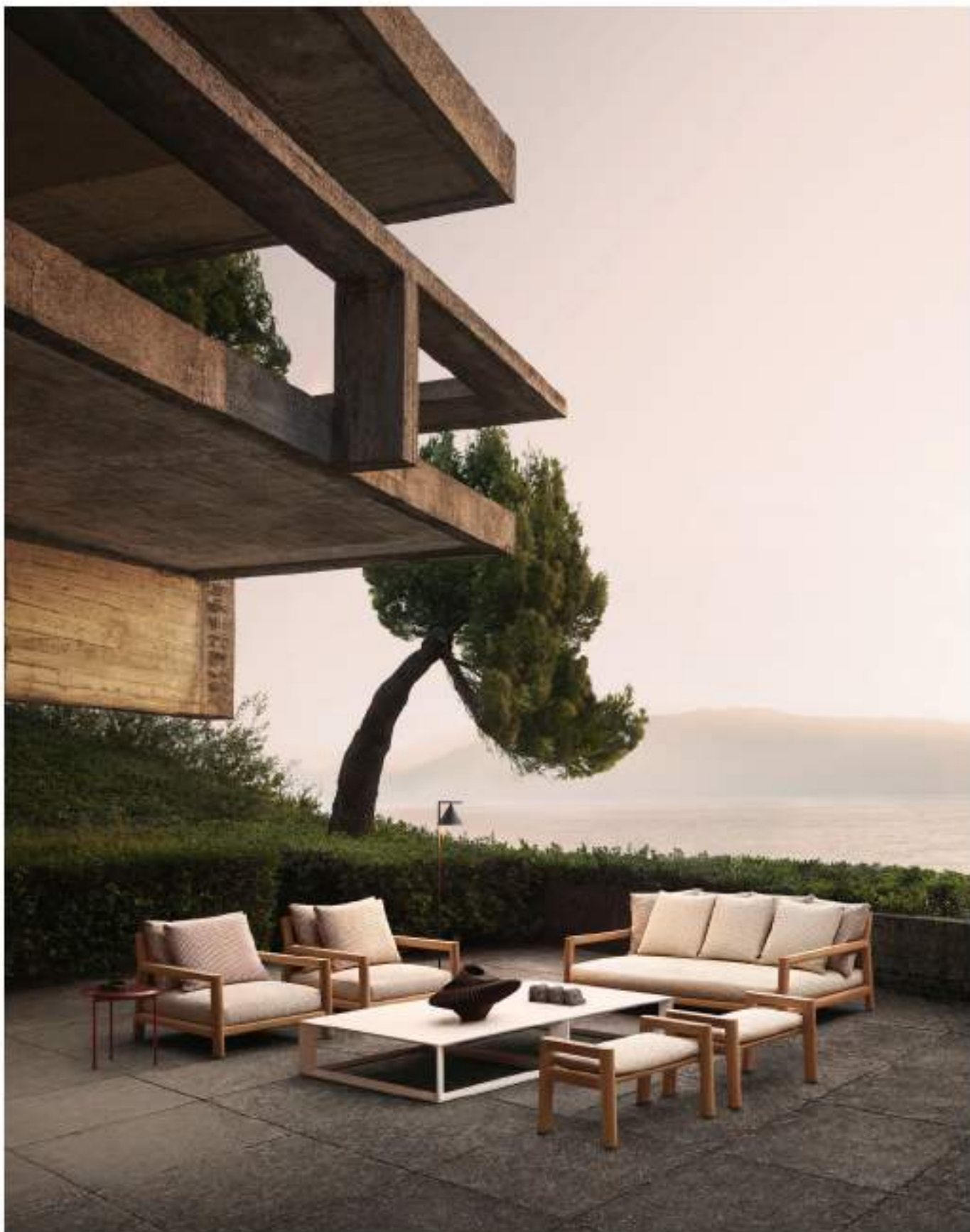
Pablo Outdoor collection, design Vincent Van Duysen. bsbitalia.com